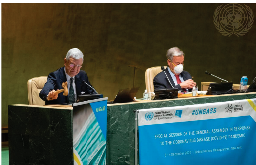
Volkan Bozkır (left), President of the UN General Assembly, during the special session to discuss the international impact of COVID, which took place in December 2020, and at which CIBJO's report was presented. He is joined at the podium by Antonio Guterres, UN Secretary General.

In April 2021, as is required by its special consultative status in ECOSOC, CIBJO submitted its written statement