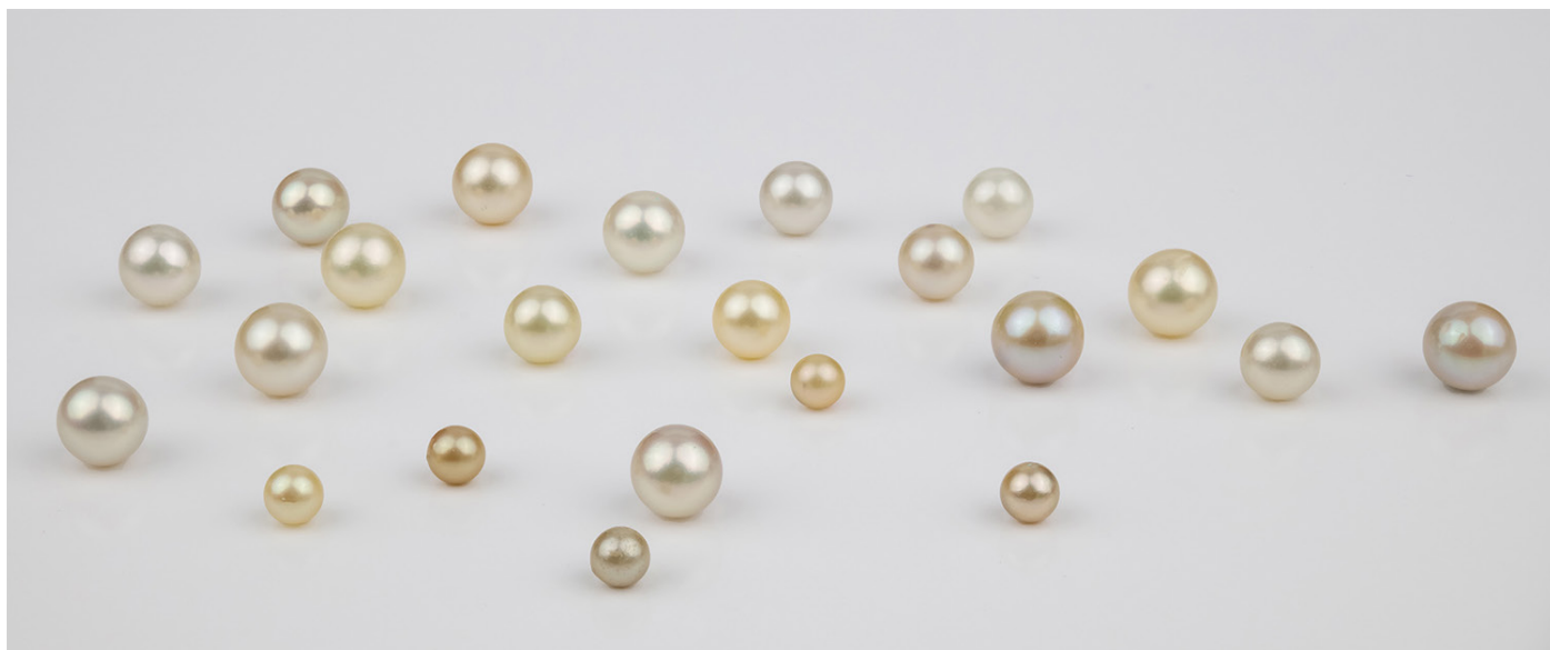
A selection of cultured saltwater pearls with bead from P. radiata cultured off Abu Dhabi ranging from 4.85 mm to 8.50 mm.