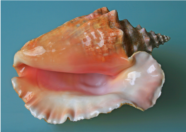
An apertural view of an adult shell of the Queen conch ( Strombus gigas , now known as Lobatus gigas ), from the Caribbean Island of Trinidad and Tobago.

conch opercula has taken off (e.g. exported from Jamaica and Nicaragua)."