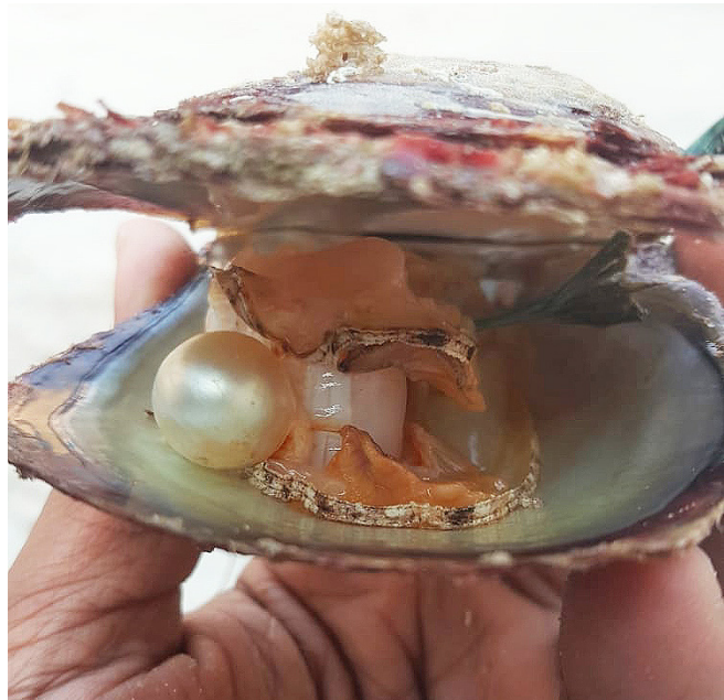
A pearl recently found within a natural pearl sac from the lower mantle of a Gulf Pearl Oyster ( Pinctada radiata ) weighing 18.07 carats and measuring 13.93 x 13.62mm.