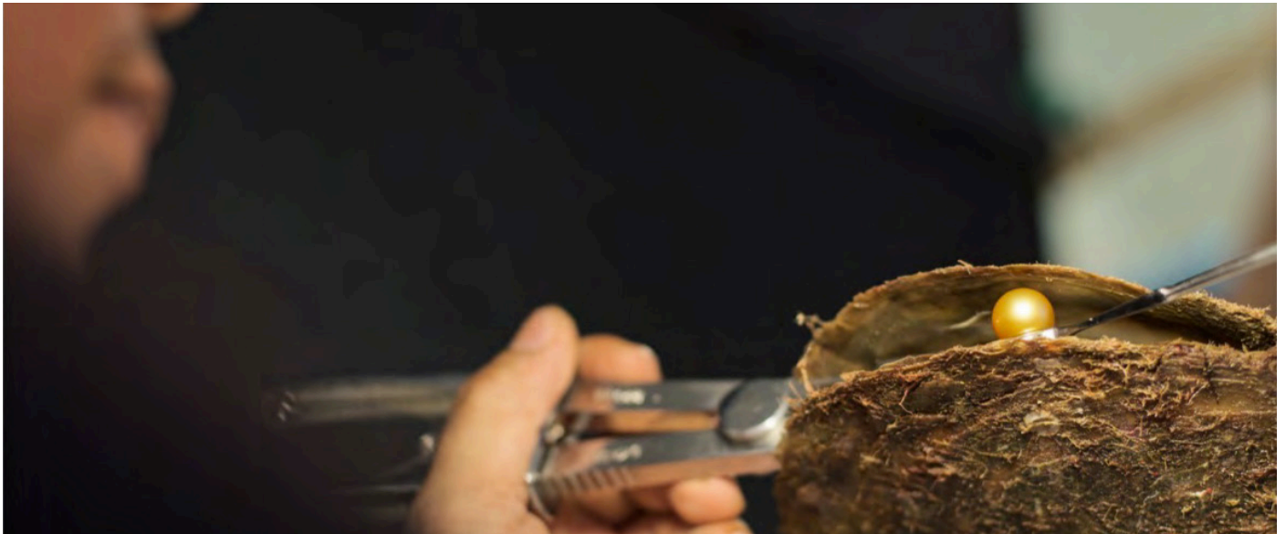
Harvesting saturated gold coloured pearls at a Jeweler pearl farm in the Philippines.

Philippine's production of cultured pearls over the coming year.