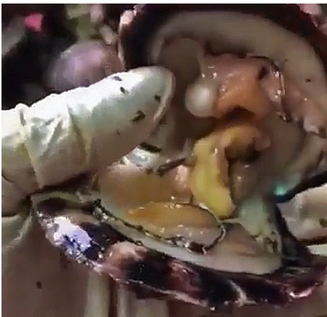
A pearl recently found dangling within a natural pearl sac from the upper mantle of a Gulf Pearl Oyster ( Pinctada radiata ) weighing 8.36 carats and measuring 11.17 x 10.73 x 9.63mm.

There are no pearl-culturing operations within Bharani waters.