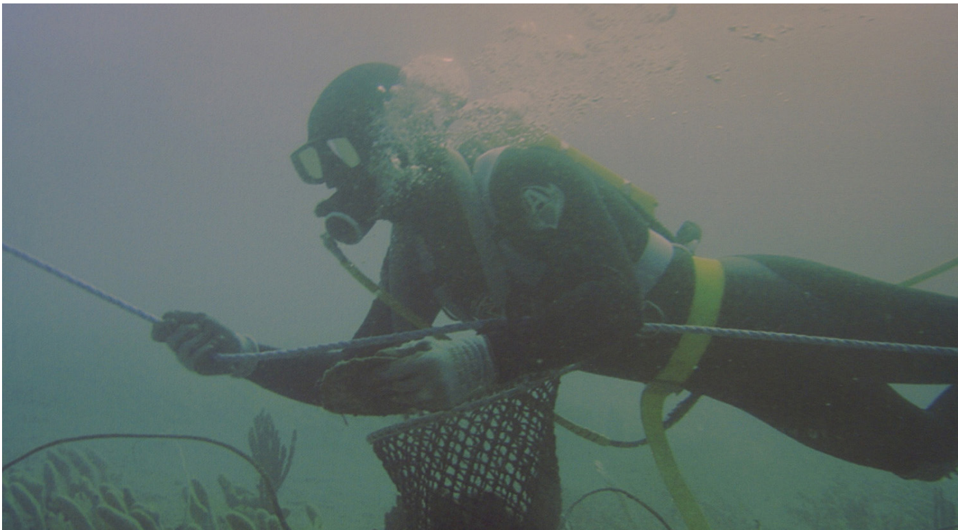
Drift diving for wild shell.