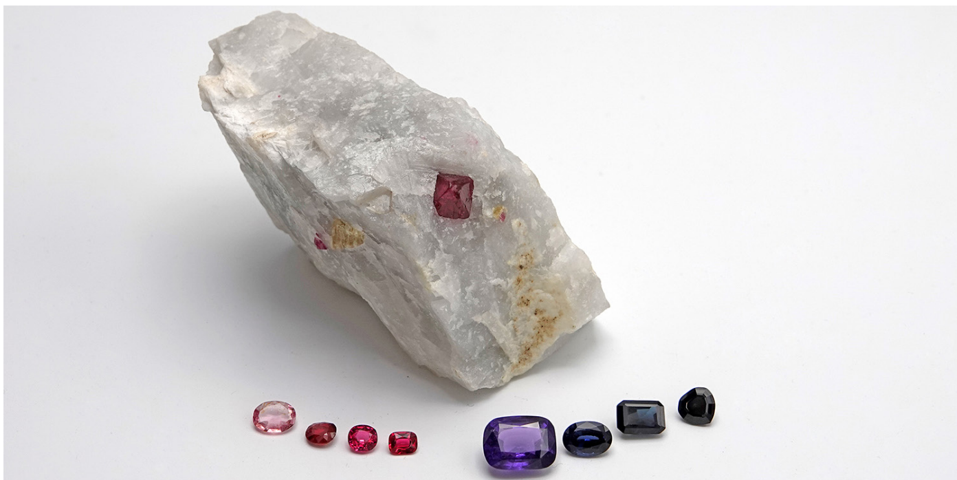
Spinel comes in beautiful shades of mainly red and blue. What defines a so-called “cobalt spinel” and what would be a blue spinel? It is the type question that the working group of CIBJO’s Gemmological and Coloured Stone Commissions will be charged with.

structure. Appearance may also be affected by crystallinity (coarsely crystalline versus micro- and crypto-crystalline; compare for example quartz and chalcedony varieties), by different degrees of porosity (as is the case with agate), or by inclusions (such as with rutiled quartz).