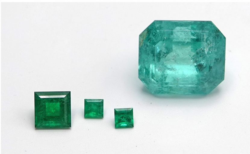
Beryl shows many shades of green, but what defines an emerald? On the left are three three smaller emeralds from Zimbabwe and one larger emerald from Nigeria. On the right is an old green beryl, reportedly from Siberia.

But the truth is that there may be a number of other judgements that are made with some degree of subjectivity, such as estimating the amount of filler used in an emerald and the use of variety or trade names.