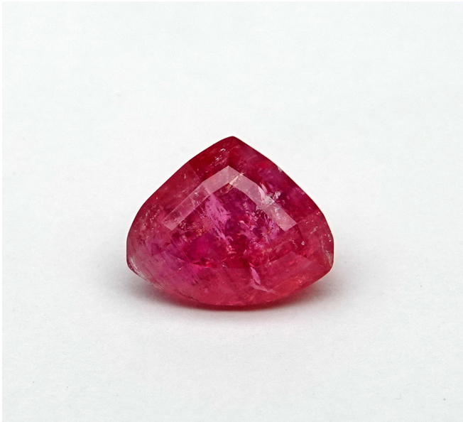
Pezzotaite, which was first defined as a new variety of beryl, but later on was identified as a new mineral, is an example of improved knowledge requiring changes to be made to the results presented on laboratory reports.

because something may have been done to a stone after it has left the laboratory.