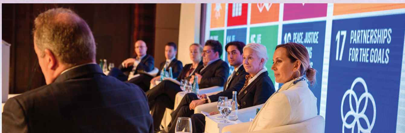
The CIBJO Congress in session in Bahrain in November 2019, during a session on responsible sourcing in the jewellery industry.

The World Jewellery Confederation is also the only organisation in the international diamond, gemstone and jewellery sectors to have received official consultative status with the Economic and Social Council (ECOSOC) of the United Nations. This enables it to advance programmes and goals of the UN within the industry, serving as a technical expert, adviser and consultant to governments and the UN Secretariat. It additionally is a member of the UN Global Compact and is committed to the fulfilment of the Sustainable Development Goals.